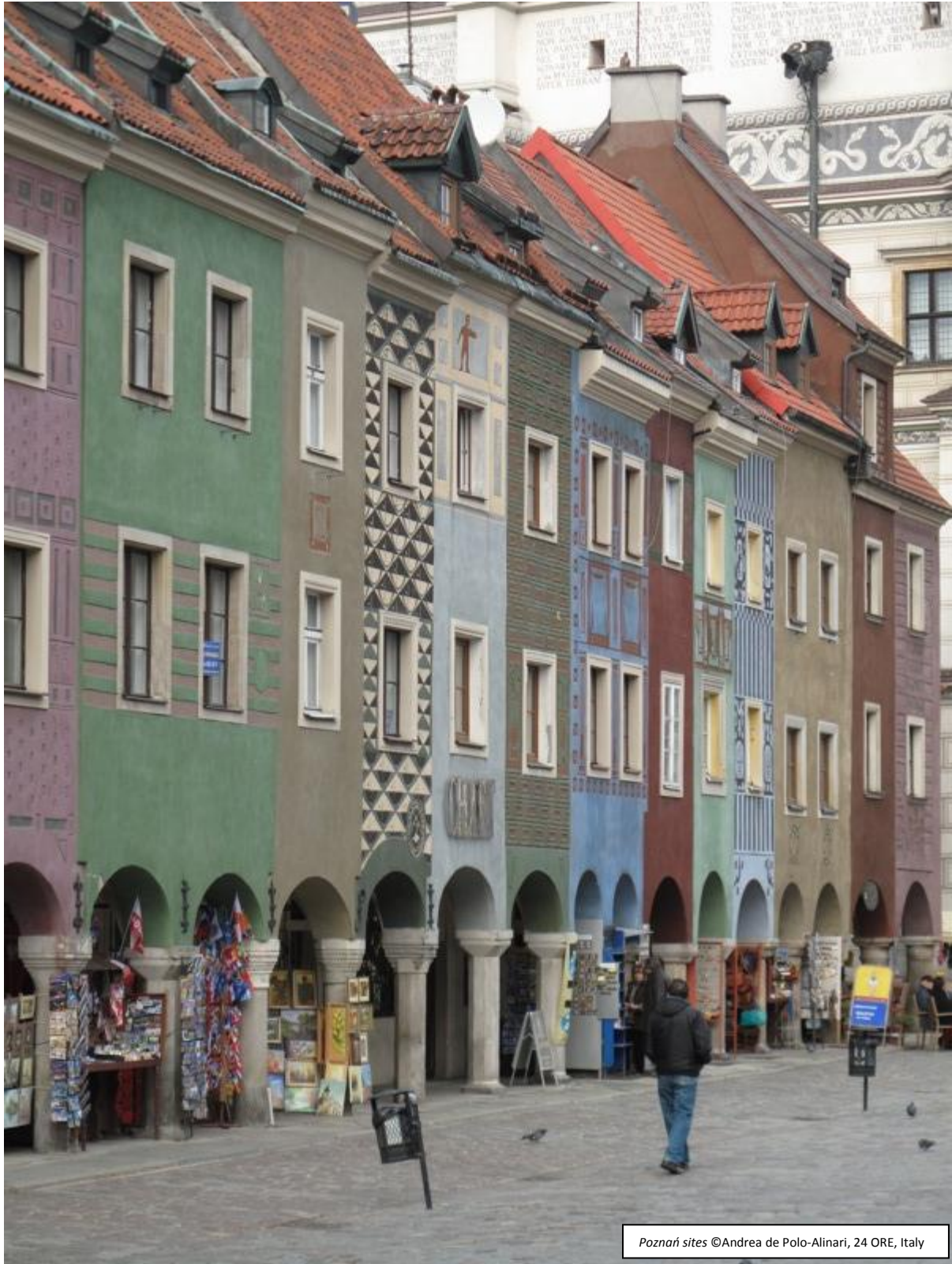
Poznań sites