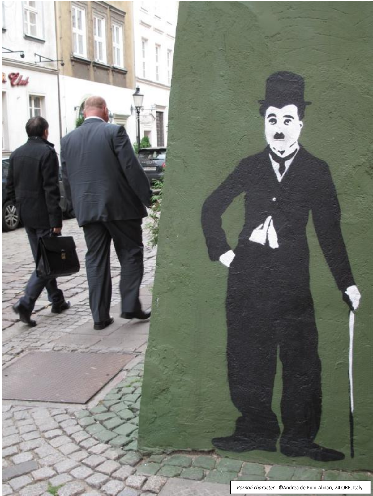
Poznań character